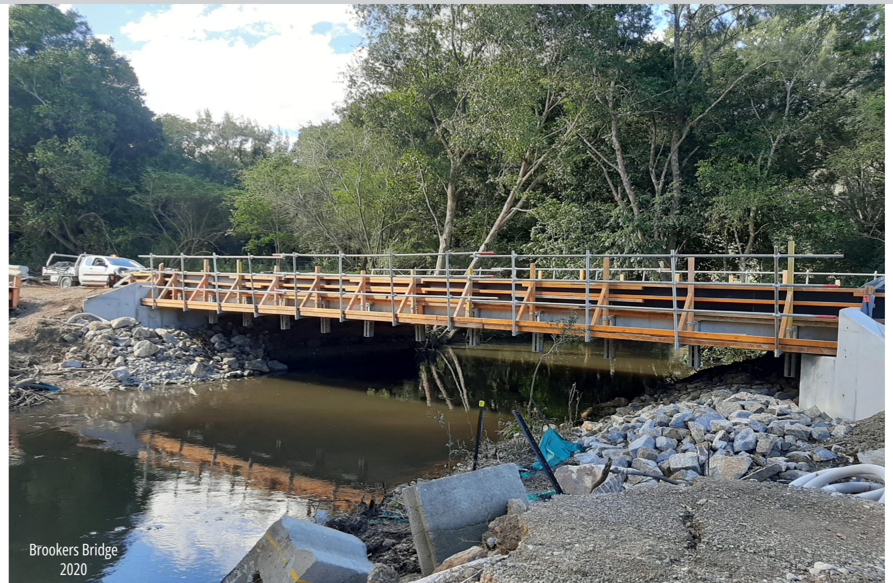
Brookers Bridge 2020