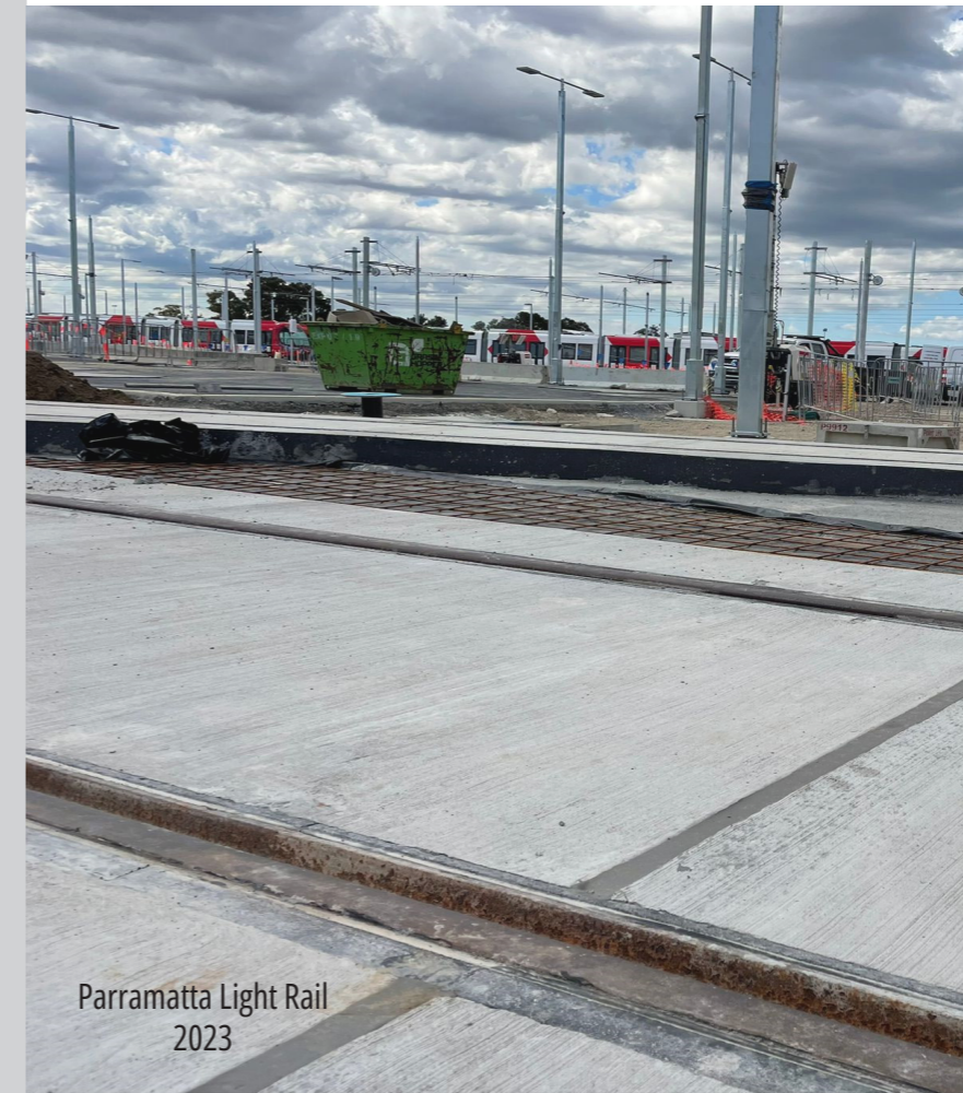
Parramatta Light Rail 2023