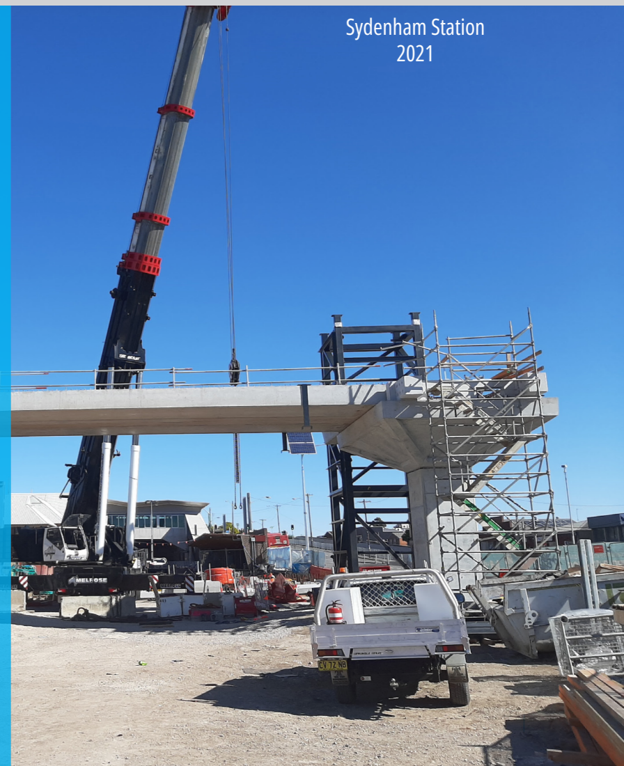
Sydenham Station 2021