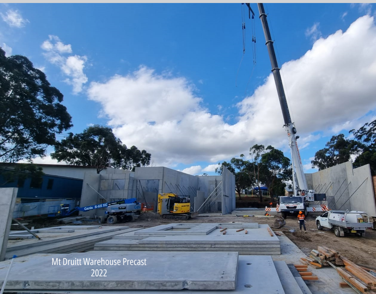
Mt Druitt Warehouse Precast 2022