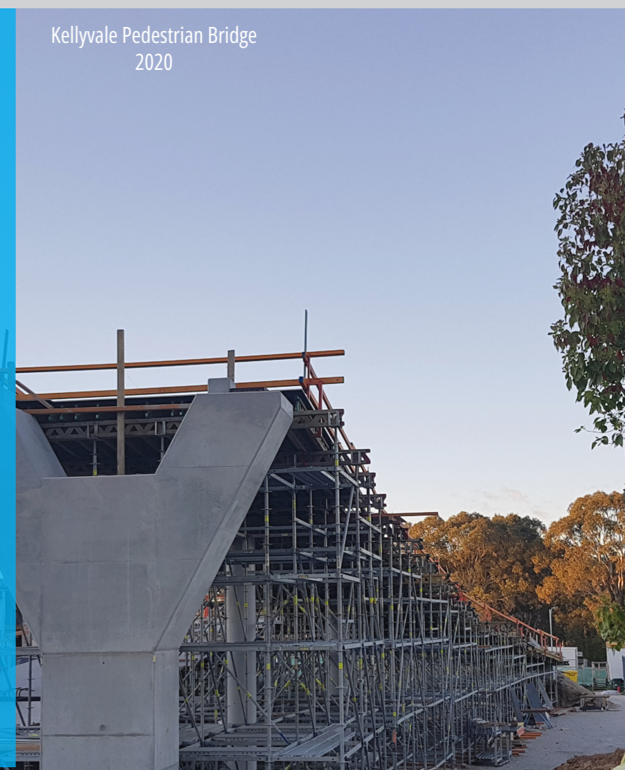
Kellyvale Pedestrian Bridge 2020