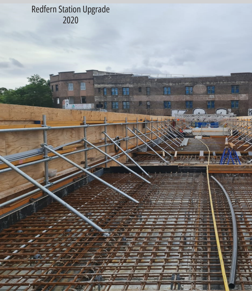
Redfern Station Upgrade 2020