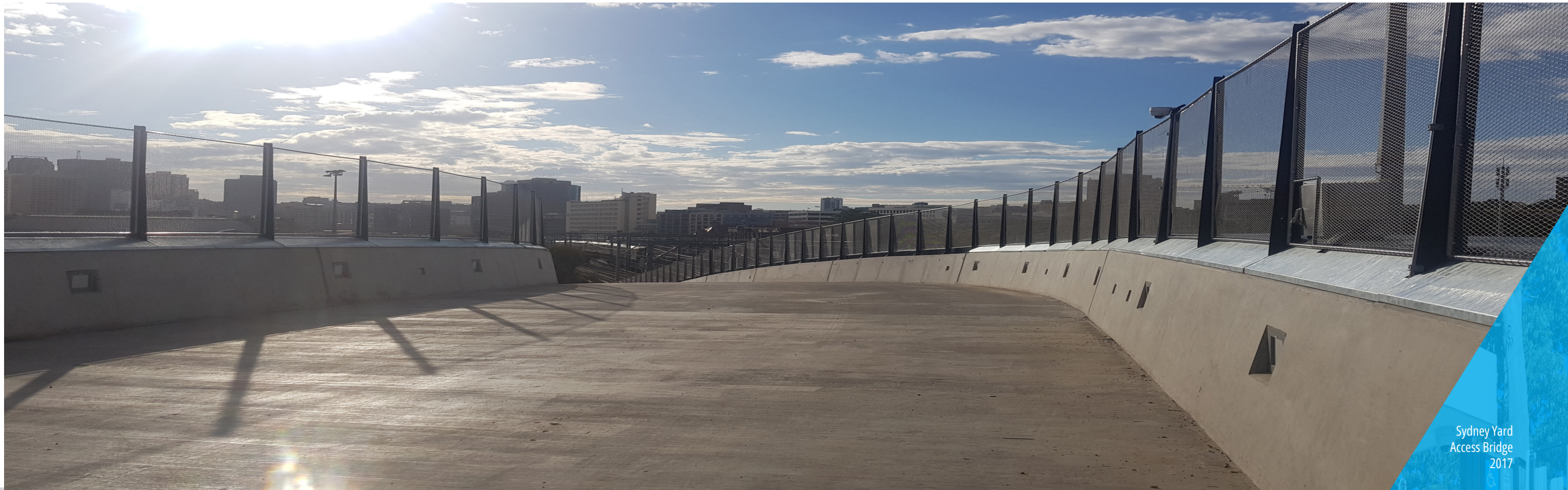
Sydney Yard Access Bridge 2017