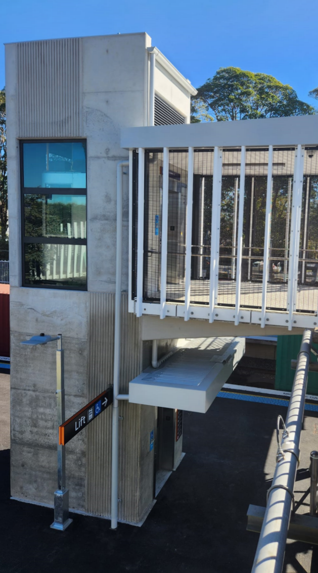
Thornleigh Station 2022