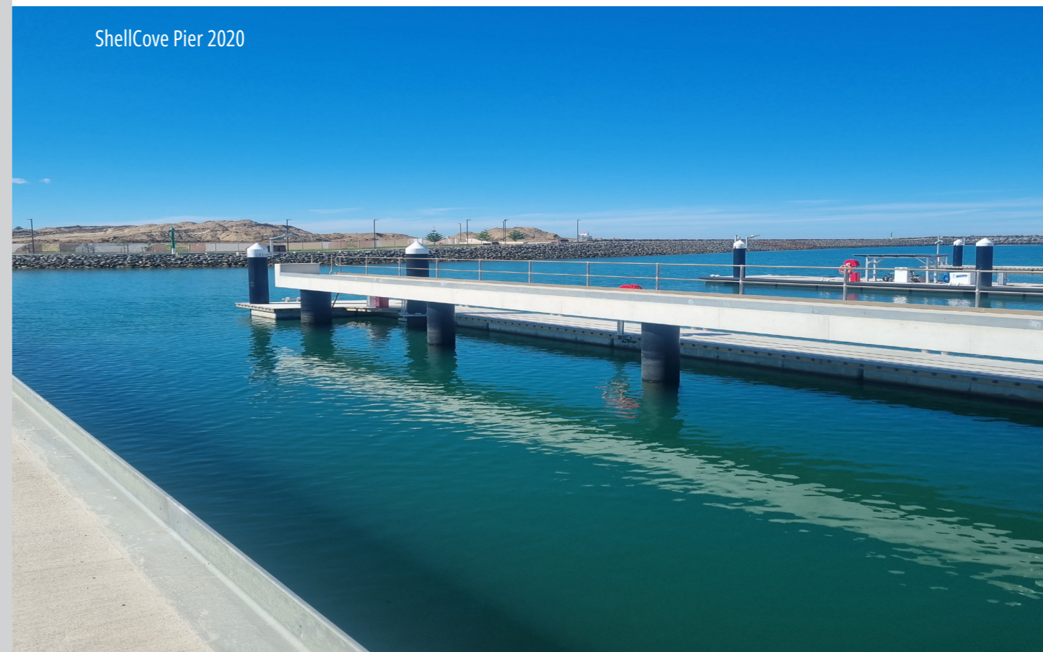
ShellCove Pier 2020