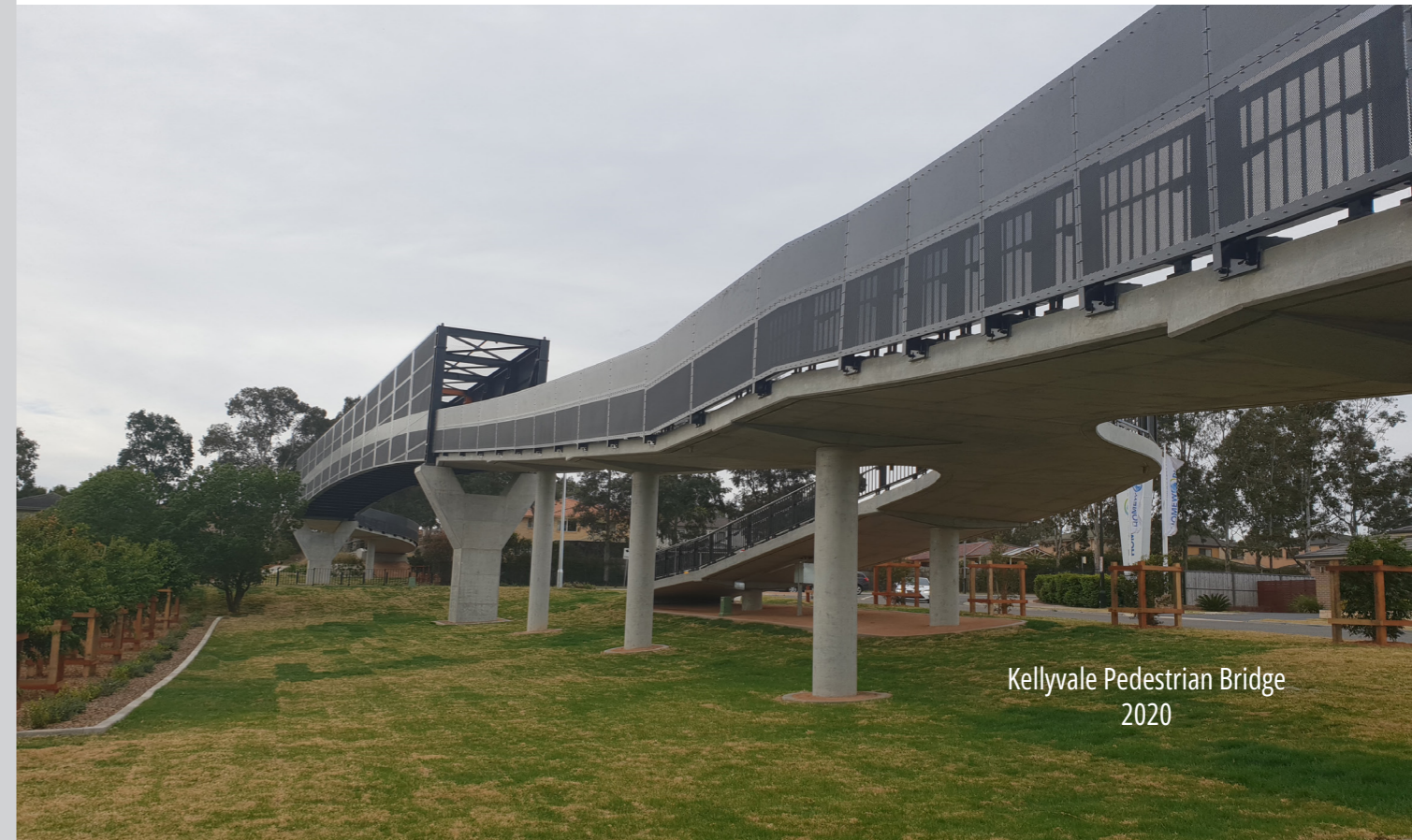
Kellyvale Pedestrian Bridge 2020