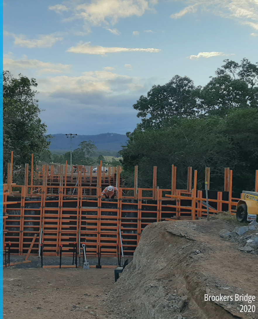
Brookers Bridge 2020