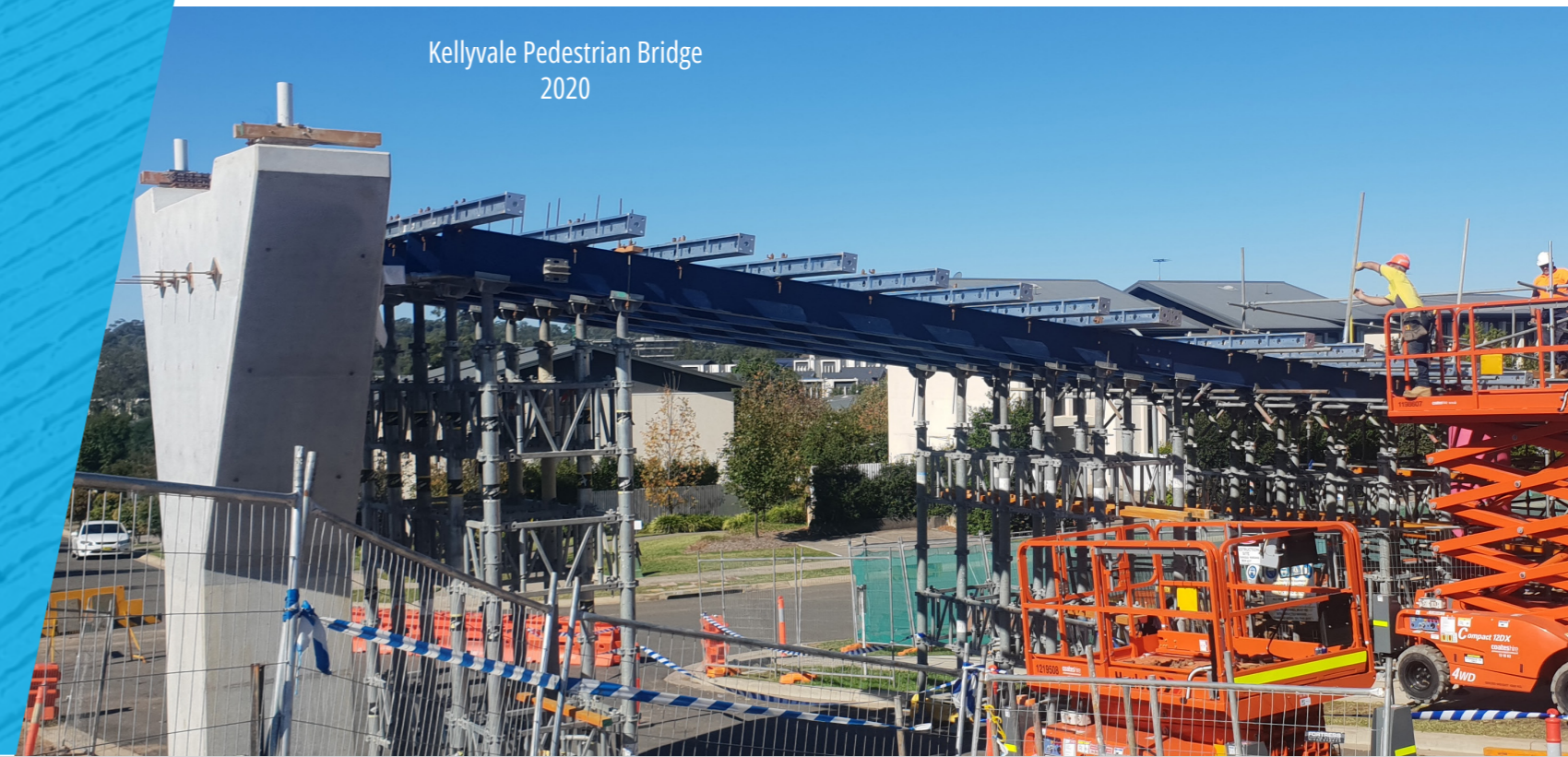
Kellyvale Pedestrian Bridge 2020