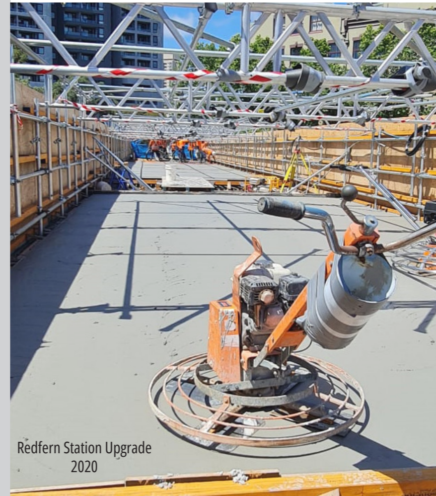
Redfern Station Upgrade 2020